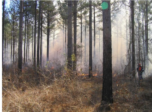
Prescribed burn in a pine forest - photo: Darren Miller

There is currently no globally accepted method for assessing biodiversity within life cycle assessment (LCA) frameworks. Modeling how biodiversity changes in relation to different forest management approaches is inherently difficult. Sustainably managed forests are dynamic systems that are affected by a host of factors that cannot be easily boiled down to a handful of cause and effect metrics. Forest biodiversity changes dynamically over time with responses to management actions often dictated by underlying abiotic factors that differ across regions (Verschuyl et al. 2008). Forest management can be optimized to achieve a wide range of biodiversity goals that can also increase habitat for target species (Demarais et al. 2017). Forest biodiversity can be enhanced through a range of options from prescribed burns to selective cutting, and can focus on management of riparian zones and wildlife connectivity. Having a discrete numerical value for the effect that forest management has on biodiversity is tempting, but current LCA methods come up short when trying to capture the important nuances of sustainable forest management. This review of recent methods shows that progress is being made at distilling complex aspects of forest management into LCA-ready values, and that there is still much work to be done before any of these models can be reliably used in LCAs.