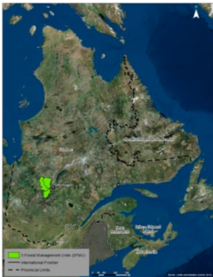
3 FMU test area in Quebec

This method estimates levels of ‘naturalness’ for different forest management practices over time to compare historic, current, and future states of naturalness for a forest.