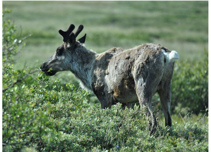
A young caribou bull taking advantage of reduced insect harassment due to high winds to forage on willow in British Columbia.

Habitat Use & Nutrition: Climate change is expected to alter where woodland caribou live, and whether habitats they forage in can meet nutritional requirements for survival and reproduction. However, it remains uncertain how changes in temperature and precipitation may impact the seasonal pattern of plant growth and the nutrient content of plant species that caribou eat. Early snow melt causing longer growing seasons on spring and summer ranges may allow forbs and shrubs selected by caribou during summer to green up earlier in the year, providing extra nutrients around the calving season (Denryter et al. 2017). However, earlier plant growth also results in an earlier decline in forb and shrub nutrients during late summer and early autumn, a period crucial for caribou to regain body fat stores needed for breeding and winter survival (Cook et al. 2021). The interplay of warmer winters and unpredictable precipitation events could disrupt caribou mobility and foraging, which, in turn, could influence body fat levels and resiliency to winter weather. If climate change reduces habitat quality and nutrition, not only could it negatively affect caribou reproduction and survival, but thinner caribou are more susceptible to threats like insects, parasites, disease, human disturbance, and predators.